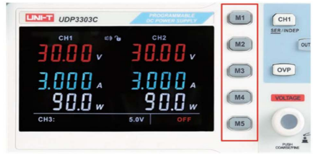
Five sets of settings to save and recall