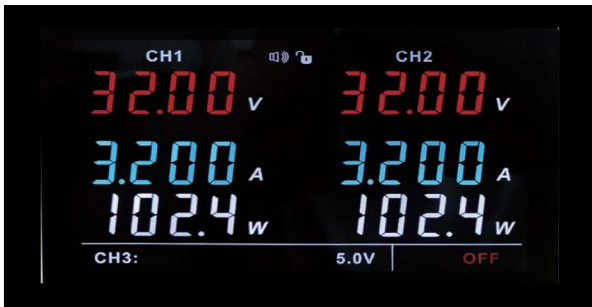
3 CH outputs, High precision Display